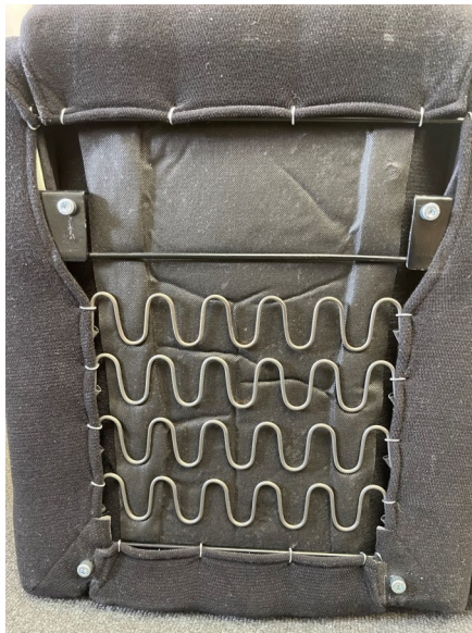
Back of Seat